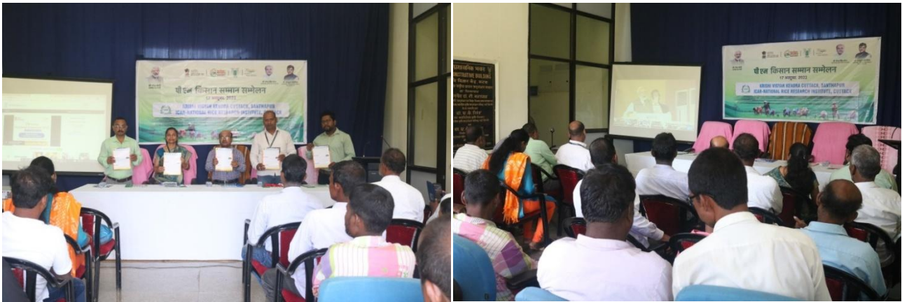
Glimpses of “PM Kisan Sammelan”