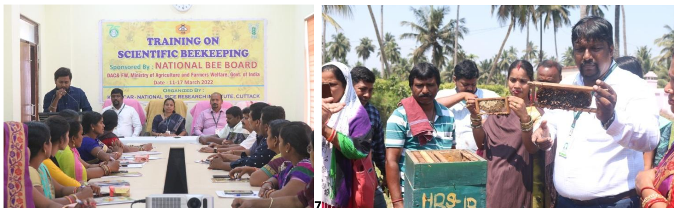
Glimpses of Training on “Scientific Beekeeping”