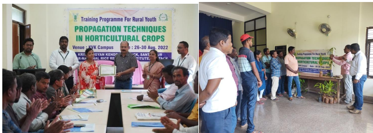
Glimpses of Training on “Propagation Techniques in Horticultural crops”