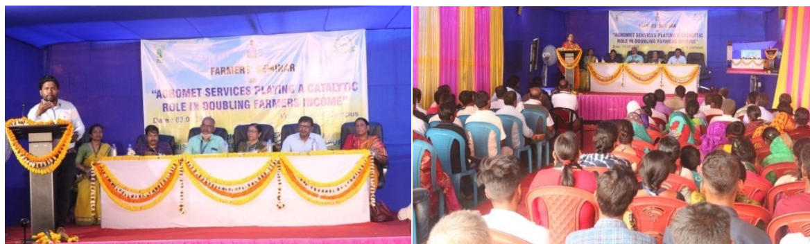
Glimpses of “Agromet services playing a catalytic role in doubling farmer income”