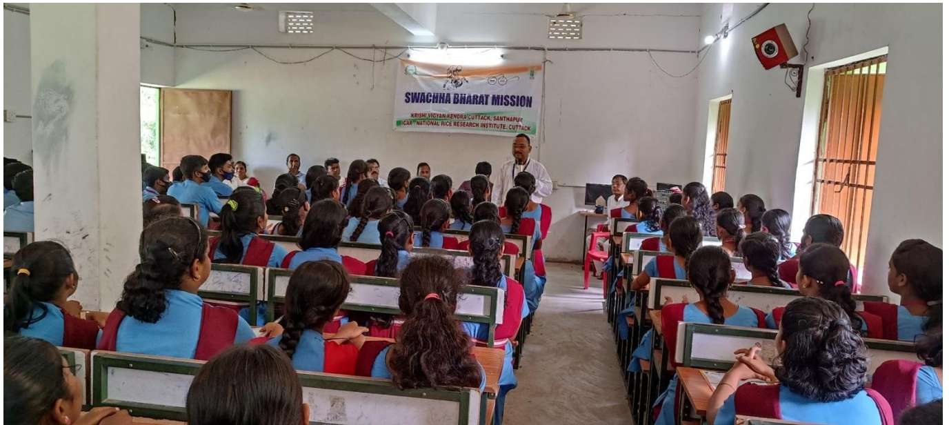
Glimpses of “Swachha Bharat Abhiyan”