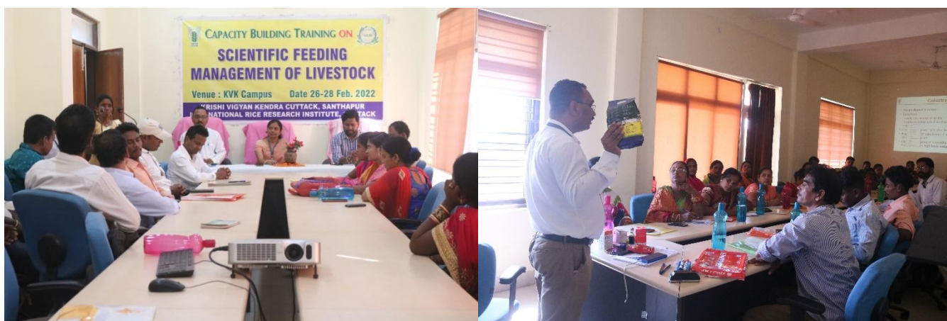
Glimpses of Training on ‘Scientific feeding management of livestock’