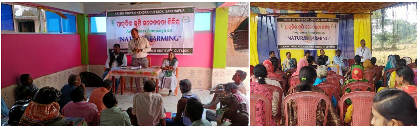
Glimpses of Awareness Campaign on “Natural Farming”