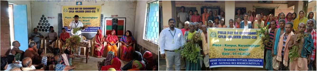
Glimpses of Field Day on “CFLD -OILSEED (Groundnut)”