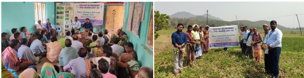
Glimpses of “Field Day on Groundnut”