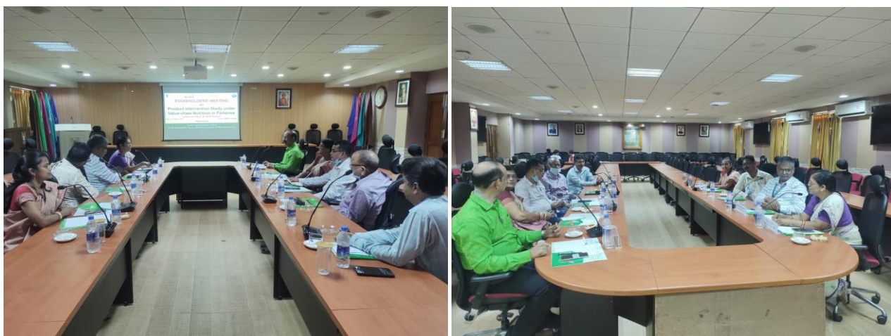
Glimpses of Stakeholders Meet on ‘Value Chain Nutrition’