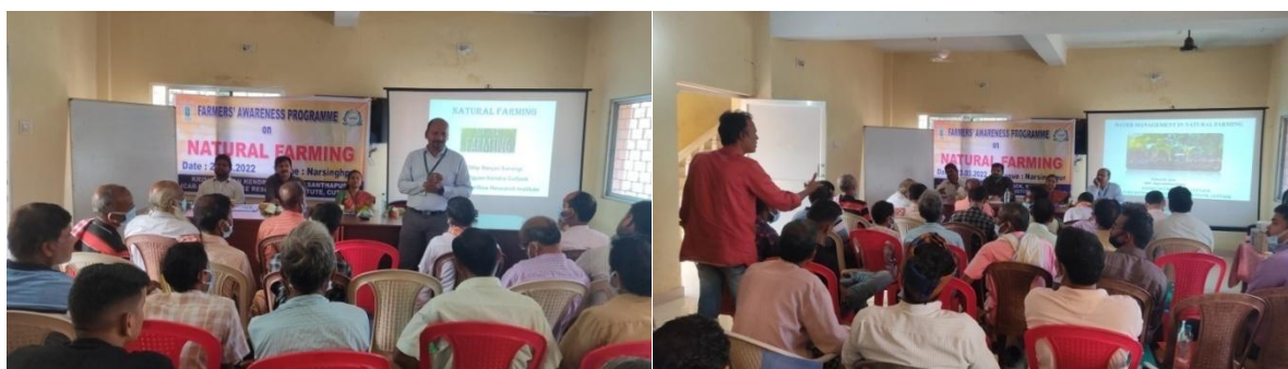
Glimpses of Awareness Programme on ‘Natural Farming’