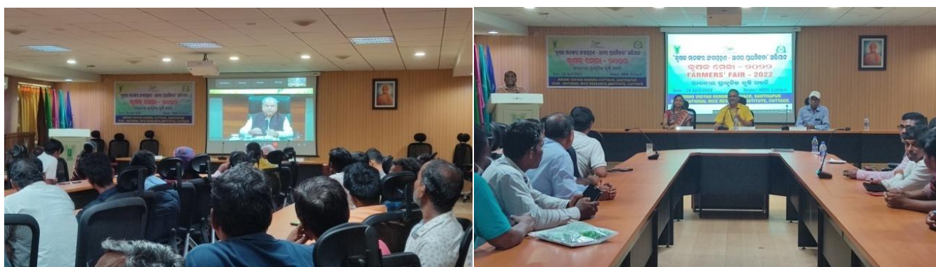
Glimpses of “Farmers' Fair under “Kisan Vagidari Prathamikata Hamari”