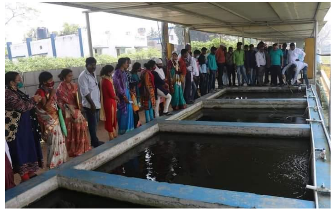
Glimpses of Training on ‘Scientific feeding of fishes’