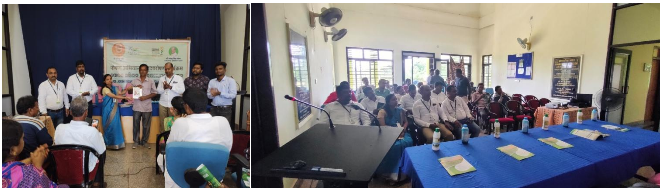
Glimpses of National campaign on “PoshanAbhiyanand Tree Plantation”