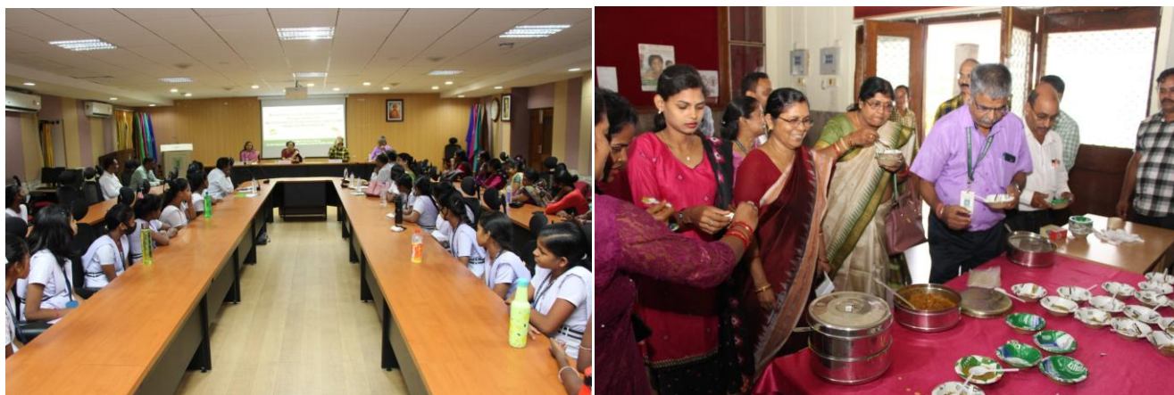
Glimpses of Awareness Programme on Fish Nutrition under World Fish Project