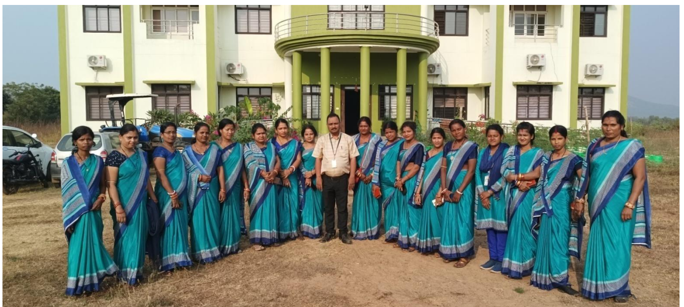
Glimpses of “Ex-Trainee Sammelan”

KVK Cuttack conducted an ex-trainee sammelan for grassroot level extension functionaries called pranimitras to sensitize them about the current epidemic prevalent in cows, namely, the lumpy skin disease. This exotic viral disease is affecting thousands of cattle across the district causing loss of some lives, but affecting most of the cattle population. To make aware the farming community a technical bulletin was prepared and distributed among the extension functionaries and farmers for effective prevention and control of the disease. They were taught different aspects of the disease and prevention methods besides how to treat the animals after affliction. The management aspects and need for vaccination was emphasized in the training program. Dr Ranjan Kumar Mohanta, SMS (Animal Science) organized the program supported by the KVK Cuttack team.