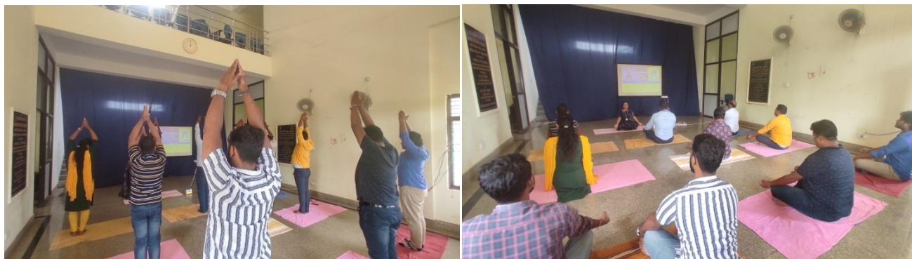
Glimpses of “International Yoga Day”