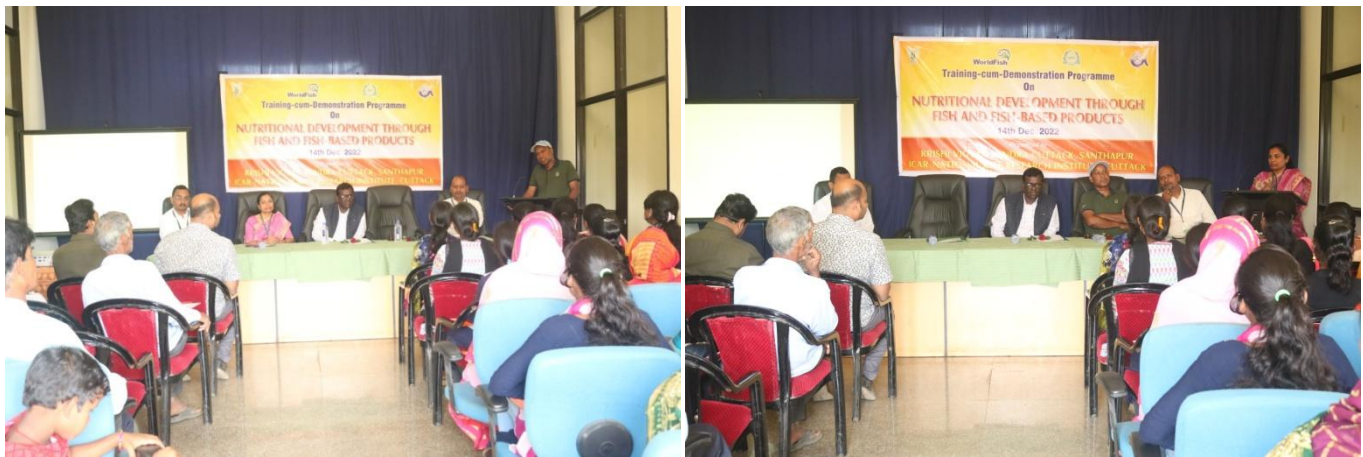
Glimpses of “Nutritional Development Through Fish and Fish Based Products”