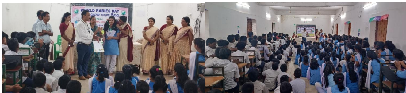
Glimpses of “World Rabies Day Awareness Campaign”