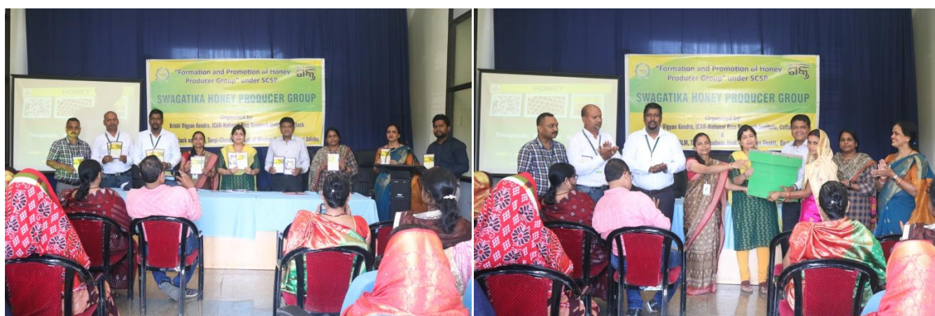
Glimpses of “Formation & promotion of honey producer group”