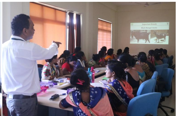
Glimpses of Training on “Advances in sheep and goat management”